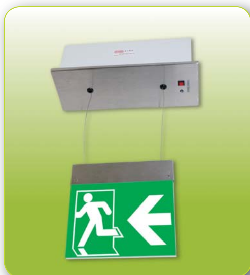
"CRYSTALITE" Cat. CX-LED-220-P-PHL- H Hairline stainless steel cover